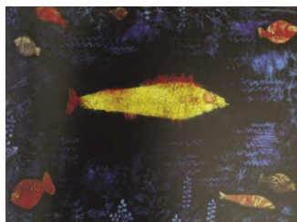
Fig. 15 The Goldfish , 1925 Hamburg Arthall, Hamburg