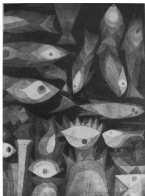
Fig. 12 A School of Fish , 1921 Private collection, Hamburg