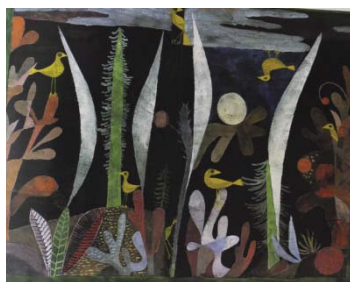
Fig. 9 Landscape with Yellow Birds , 1923 Private collection, Basel