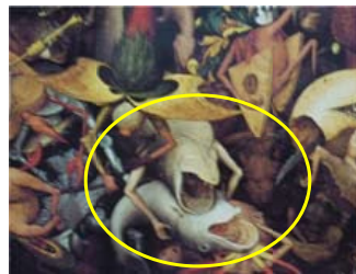
Fig. 4 Pieter Brueghel The Fall of the Rebel Angels , 1562 Royal Museum, Brussels