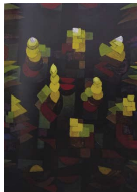
Fig. 13 Growth of Plants , 1921 Pompidou Centre, Paris.