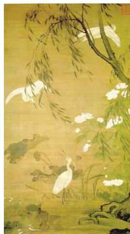
Fig. 7 呂紀 秋鷺芙蓉, Ming Dynasty National Palace Museum, Taipei