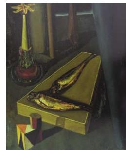
Fig. 3 Giorgio de Chirico Sacred Fish , 1918 The Museum of Modern Art, New York