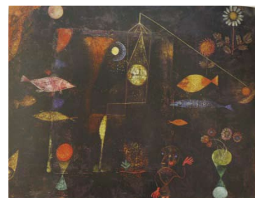
Fig. 10 The Fish Magic , 1925 Philadelphia Museum of Art