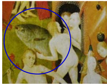
Fig. 2 Hieronymus Bosch The Garden of Earthly Delights , The Prado, Madrid (the parts of the central panel)