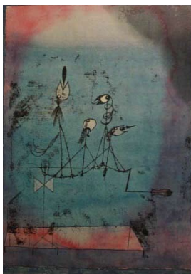
Fig. 8 The Twittering Machine , 1922 The Museum of Modern Art, New York

The primitive forms and lines of these two works play an important role in each. Fish which have very simple anatomy attract humans. They are sometimes regarded as food, sometimes as objects of aesthetic beauty, and at other times as freely swimming animals in water. Klee skillfully manipulates the form and line in order to describe the essence of movement, feature, and existence with his own characteristic expression of humour, and symbolization. Fish became a major motif in Western painting beyond religious metaphor. By means of reduction to essential forms and lines through the fish's own anatomy, Klee expressed something important that is related to life and death through his drawings of fish. This unique idea, conveyed through the primitive forms and lines is a part of the essential philosophy of Klee's art.