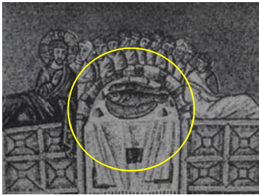
Fig. 1 Mosaic art of the Last Supper in Church of Sant' Applinare, 6c. Nuovo, Ravenna