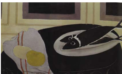
Fig. 6 Georges Braque Black Fish , 1942 Pompidou Centre Paris