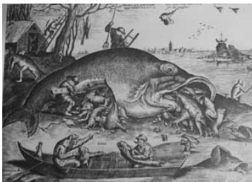
Fig. 3 Pieter Brueghel A Big Fish Engulfs Small Ones , British Museum, London