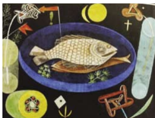
Fig. 14 Around the Fish , 1925 The Museum of Modern Art, New York