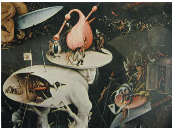
Figure 8 Bosch The Garden of Worldly Delights: Hell (the right panel)

religiously perceptive implications, and people who saw them are seized with a kind of fearfulness, the implication of the pictures of hell has another aspect. It is repeatedly suggested that those images have humour. Japanese pictures of hell show various hellish worlds which tells people who see them the torments of sinners as a retribution of all kinds of sins. Those pictures basically present the idea of Buddhism which shows the consequence of sins committed in this world, and the fearful retribution exposed in the other world. Fiends as hell keepers torment sinners according to the precept of Buddhism. Transformed hungry demons are the figures of people who committed sins in this terrene world, exposing their ugly and despicable appearances. In 'Tokatsu' Hell, people as sinners are dipped in feces and urine and eaten by insects which have hard bills like birds 22) (Figure 9). The essential image and landscape of the hell are almost the same between the Western and the Eastern paintings. People are more or less treated as sinful beings.