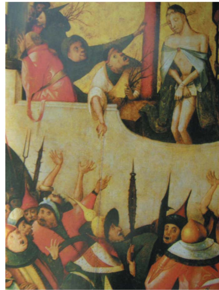
Figure 13 Bosch Ecce Homo (the detailed part) 1500-04? Philadelphia Museum of Art

Merciless cruelty and sardonic humour are also important factors of Bosch’s paintings. The grotesque monsters which afflict humans are metamorphosed creatures; fish, flowers, reptiles, birds, plants, insects, or the various instruments for daily use of humans are combined with each other, becoming monstrous. People are cruelly cut up into pieces, spitted by a sharp halberd, or stabbed by a knife through the neck. Creatures kill them without any hesitation. People are powerless before their