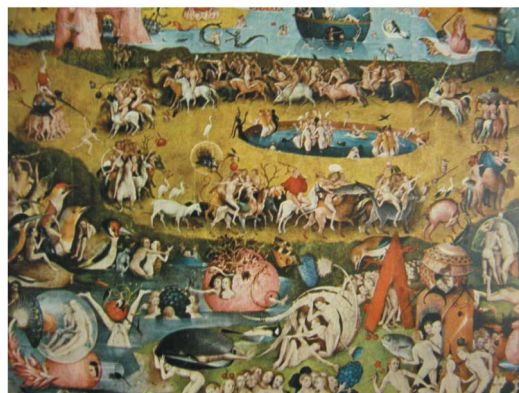
Figure 7 Hieronymus Bosch The Garden of Worldly Delights: Paradise 1505-16? (the central panel) The Prado, Madrid

As Hieronymus Bosch himself was a fervent Catholic, and belonged to the Brotherhood of Our Lady, it is hard to believe that he painted his works from an anti-Christ, atheistic and heretical view. The time when he lived was just before the Reformation. His paintings were so popular that the Spanish Royal Household ordered works from his atelier. Bosch's scopophilic imagination is, as many critics suggest, beyond that of many religious painters, because he had shown peculiar and deep insights which focus on human's essence through his works. In Gardens of Earthly Delights , Bosch painted Imaginary Paradise in