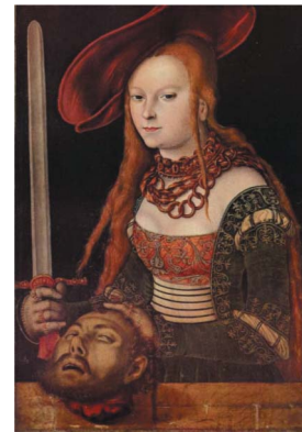
Figure 2 Lucas Klanach Judith with the Head of Holofernes , 1530 Kunsthistorisches Museum, Vienna

The other aspect of grotesqueness is a psychological illusion. Paintings of Alfred Kubin provide such grotesque images based on the cruel illusion which usual people never wish to see. The essence of his paintings is surely describing what no one wants to see. So it is easy to suppose that he affected H.R. Giger in later age. It can be assumed that Kubin's image was created by grotesque obsession with extremely sexual desire and fear of death. He prefers to paint grotesque figures, including a half-god with serpent body, a female sucked by mollusks, a female body with serpent head and mammal's limbs. And the other type is the image of murder. In many cases, both male and female are chopped with sharp knives. The