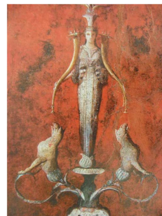
Figure 5 The panel of the wall of Villa della Farnesina (last quarter of the 1st century B.C.) in Ornaments and the Grotesque : metamorphic motif, figures and animals growing out of plants.

According to Zamperini's suggestion, there were arguments put forward against the grotesque art. Roman architect, Vitruvius judged grotesque iconography as peripheral decorations. Horace, similarly, regarded them as marginal and trivial figures. From the view point of classical and traditional art, 'unreal' and abstract depictions were improper and Hellenistic products influenced by oriental cult art. Such contaminated art was not accepted by those traditional intellectuals. However, by the Augustine period, cultural aspects had changed. Oriental and Hellenistic aspects against ancient Greek and Roman classical cultures affected creative imagination of art. In the Neronian period, the notion of abstract and unreal decoration and designs was accepted and introduced in the paintings of that time. Griffins and hybrid creatures as peripheral decorations gradually spread as typical motives of art decoration systems. Although grotesque decoration and designs are quite common in the 21st century in art or illustration, it was difficult for the original notion to be accepted by people