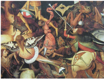
Figure 1 Pieter Bruegel The Fall of the Rebel Angels (a part), 1562 Musées Royaux Beaux-Arts de Belgique, Bruxelles