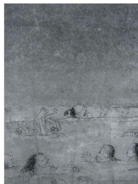
Figure 9 'Tokatsu' Hell National Museum of Nara

Another masterpiece of Bosch, The Temptation of Saint Anthony is a representative and well-known work, and the motif of which was so frequently used by many painters, including Matthias Grünewalt, Max Ernst, Salvador Dali, and others. But Bosch's Saint Anthony is significantly prominent among others (Figure 10). The triptychs are effective on his art. In every panel, there are tremendous crowds of grotesque creatures around St. Anthony who seems not to be frightened of them. It is important that St.