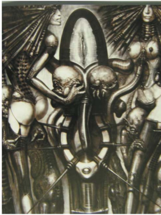
Figure 4 H.R.Giger Hexentanz , 1977

necessary to define the origin of the term 'grotesque'. This was originally a traditional concept of European Art. It is frequently referred to in the ornaments of buildings, which represent figures of humans, plants, and animals of nature. It is a well known fact that the origin of the word derives from Latin, "grotto" which means a cave or a hollow place 1 ). Although the imaginary creatures such as unicorn, dragon-like living things, or demonish creatures gradually began to appear as ornaments in later times, the original concept traces its history to ancient Roman art. The discovery of Domus Aurea enhanced the development of the idea of the 'grotesque', leading to the supreme prosperity of Christian art in the Romanesque and Gothic eras.