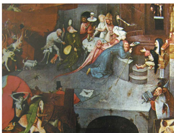
Figure 10 Bosch The Temptation of Saint Anthony (a part of the central panel) 1505-6? Museu Nacional de Arte Antiga, Lisbon