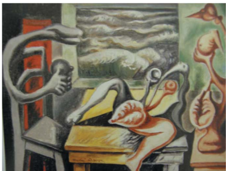
Figure 6 André Masson Pygmalion 1938 Collection particulière

It is necessary here to examine one of the most impressive painters, Hieronymus Bosch (1450?-1516) from the Netherlands, who was famous for his peculiar paintings. Bosch immediately reminds us of the peculiarly grotesque creatures (grillo), most of which were made by combinations of humans with living things, with various instruments; human body parts are combined with a bud of a flower and bird's wings, a lizard's body and a flute, an egg body with a human's head and legs of trees, fish's head and butterfly's wings with armor and human's legs. These outrageous outfits appear creepily humorous and satirical. The ominous metamorphosed images are the