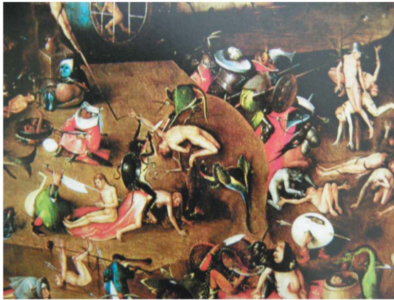
Figure 12 Bosch The Last Judgment (detailed of the central panel) the date unidentified Akademie der Bildenden Künste, Vienna

his life with the ominous creatures, praying, or thinking deeply in meditation (Figure 11). Bosch tried not to depict the scene of “temptation”, but to express the human essence of St. Anthony and the surrounding grotesque world. The core of the triptychs is the lurid grotesqueness of the world around St. Anthony. The fact that all is grotesque except St. Anthony is the factor which made this painting remarkable. The world filled with these creatures which is the structure of this triptychs represents Bosch’s worldview. Therefore, Bosch described the thoroughly grotesque world minutely in detail. The structural grotesqueness expressed Bosch’s values and philosophical ideas. Although the figure of St. Anthony is tiny in the three scenes of the triptychs, his composure is clearly proposed among those mad creatures and the mad world. Other painters never described a form of madness like the one painted by Bosch. The uprightness of a human (but at the same time, the vulnerability) is brought into relief among grotesque madness.