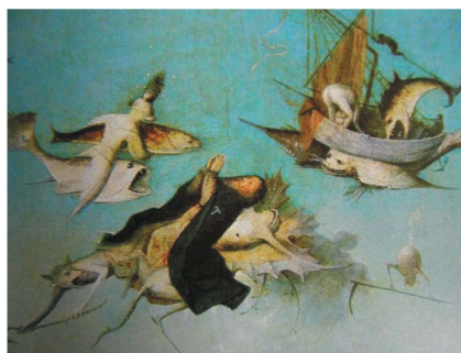
Figure 11 Bosh The Temptation of Saint Anthony (the detailed of the left wing)

Anthony is not scared of those weird creatures at all. As Carl Linfert pointed out, there is no ordered story for the triptychs; 'Neither the beginning nor the end of his tormented existence is to be read here, but only the steadfast composure — call it asceticism or contemplation — which is the lesson of his legend 23) '. St. Anthony lives